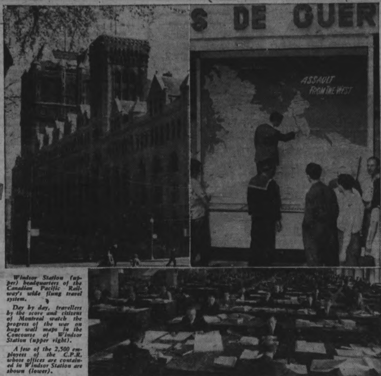
Windsor Station (upper) headquarters of the Canadian Pacific Railway's wide flung travel system.